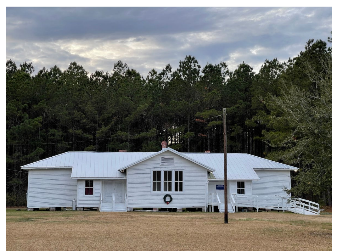
Façade, facing west.