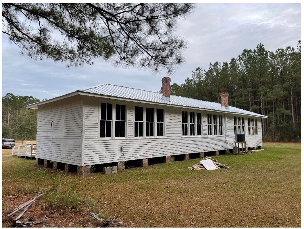
Rear elevation, view to the southeast.