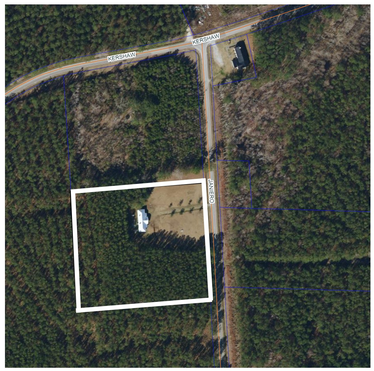
Site Map with National Register Boundary