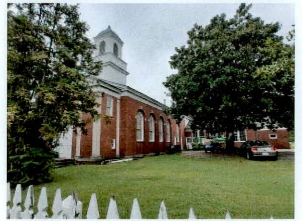
CV3307 New Bern Historic District BI and AD _02.jpg