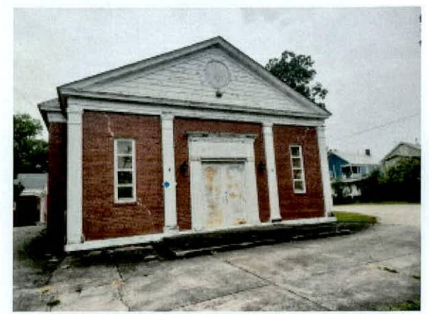
CV3307 New Bern Historic District BI and AD _03.jpg