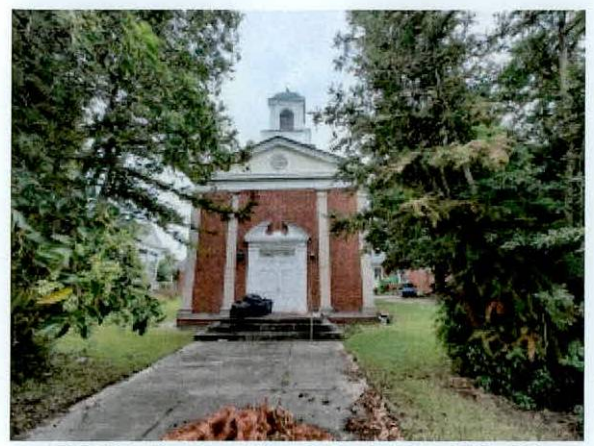
CV3307 New Bern Historic District BI and AD _01.jpg