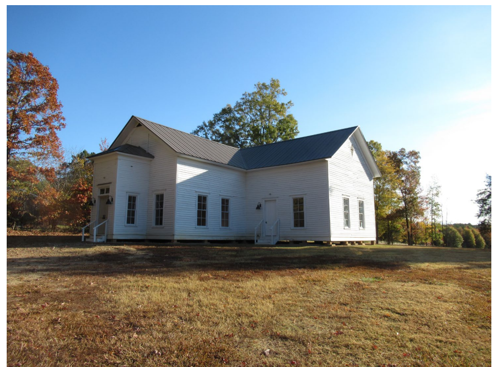
Exterior View to NE