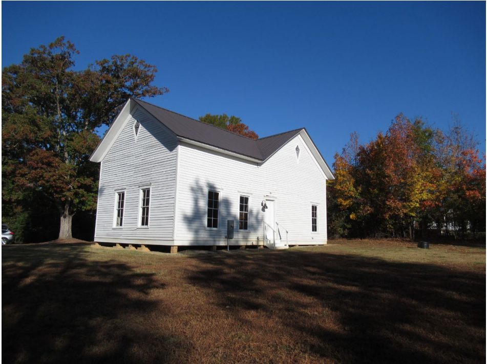
Exterior View to NNW